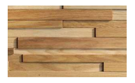
W1008 Oak Wood 1200mm x 200mm x 11mm