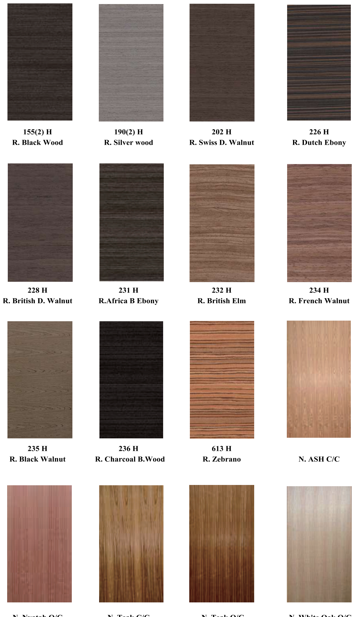
N. Nyatoh Q/C N. Teak C/C N. Teak Q/C N. White Oak Q/C All the products shown here are before varnishing. Veneer colour will change after varnishing process. Different batches of veneer may have slight colour variations.