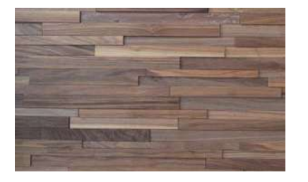
W1004 Black Walnut Wood 1200mm x 200mmx11mm