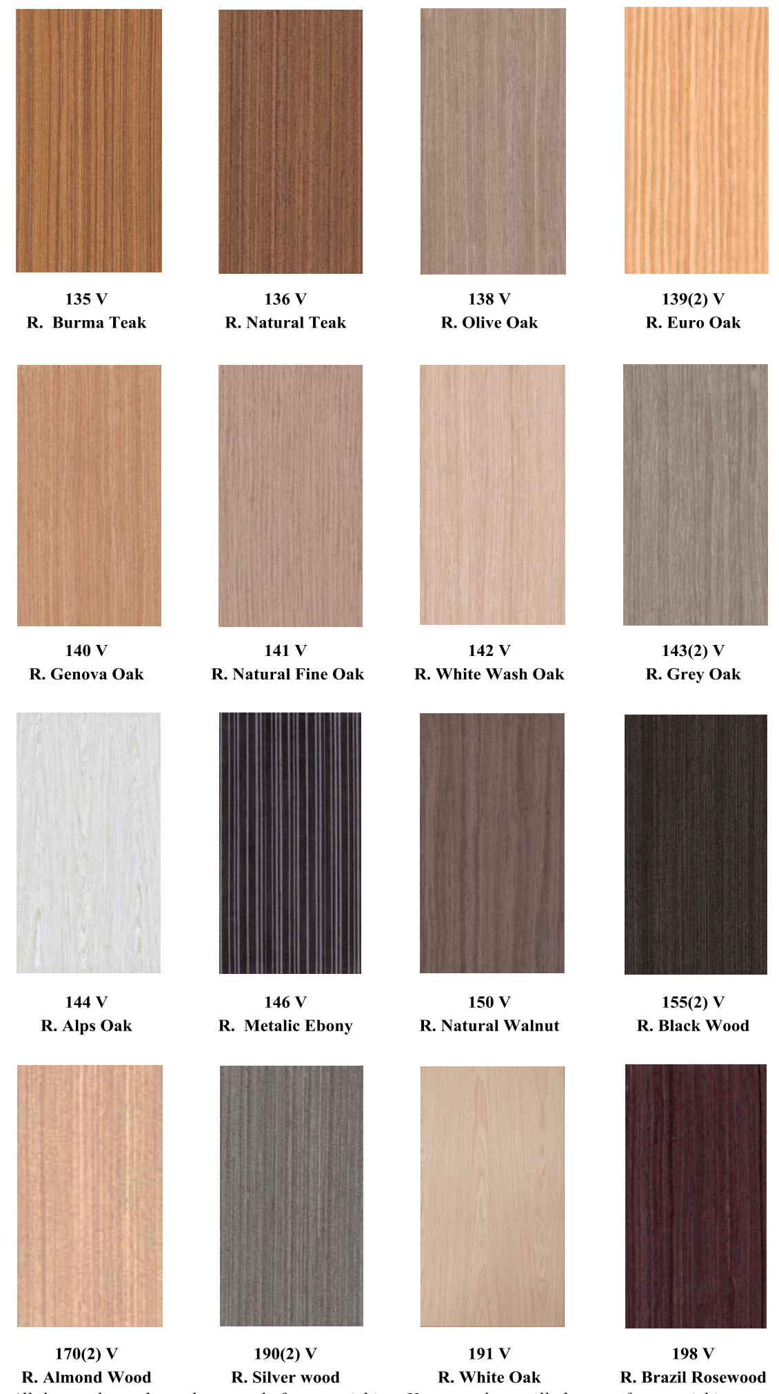
All the products shown here are before varnishing. Veneer colour will change after varnishing process.