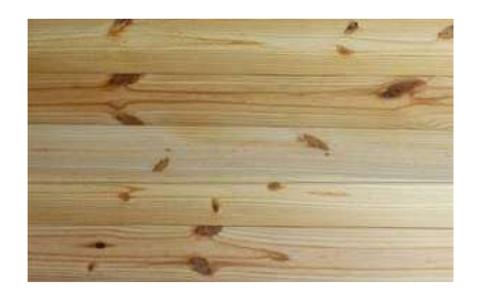
W1009 Country Knotty Pine 2440mm x 125mm x 12mm