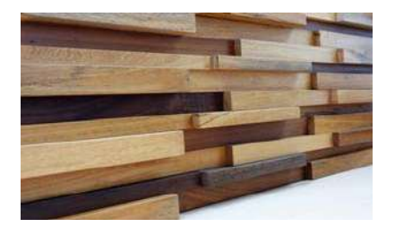
W1001 OWT Smoked Wood 900mm x 200mm x 40mm

Beyond the eco-responsibility of reusing materials, it is indisputable that our wood panel brings beauty and character that nothing else can.