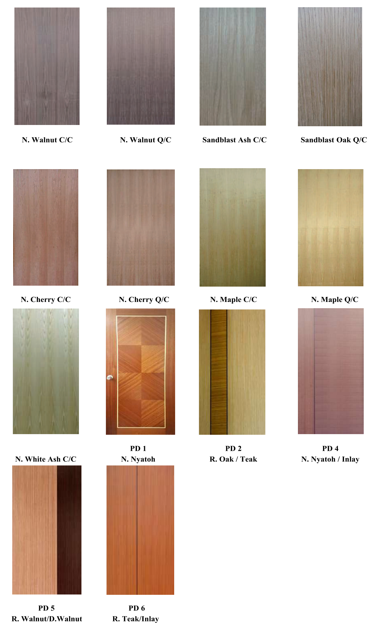
All the products shown here are before varnishing. Veneer colour will change after varnishing process. Different batches of veneer may have slight colour variations.