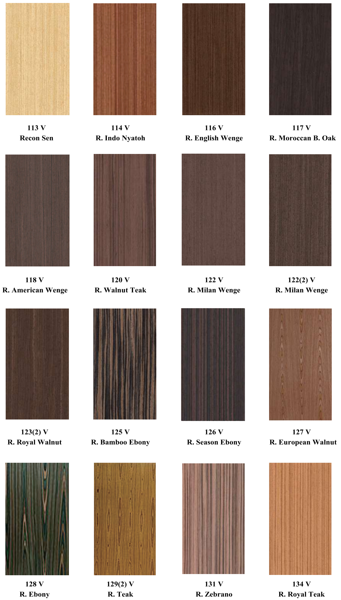
All the products shown here are before varnishing. Veneer colour will change after varnishing process.