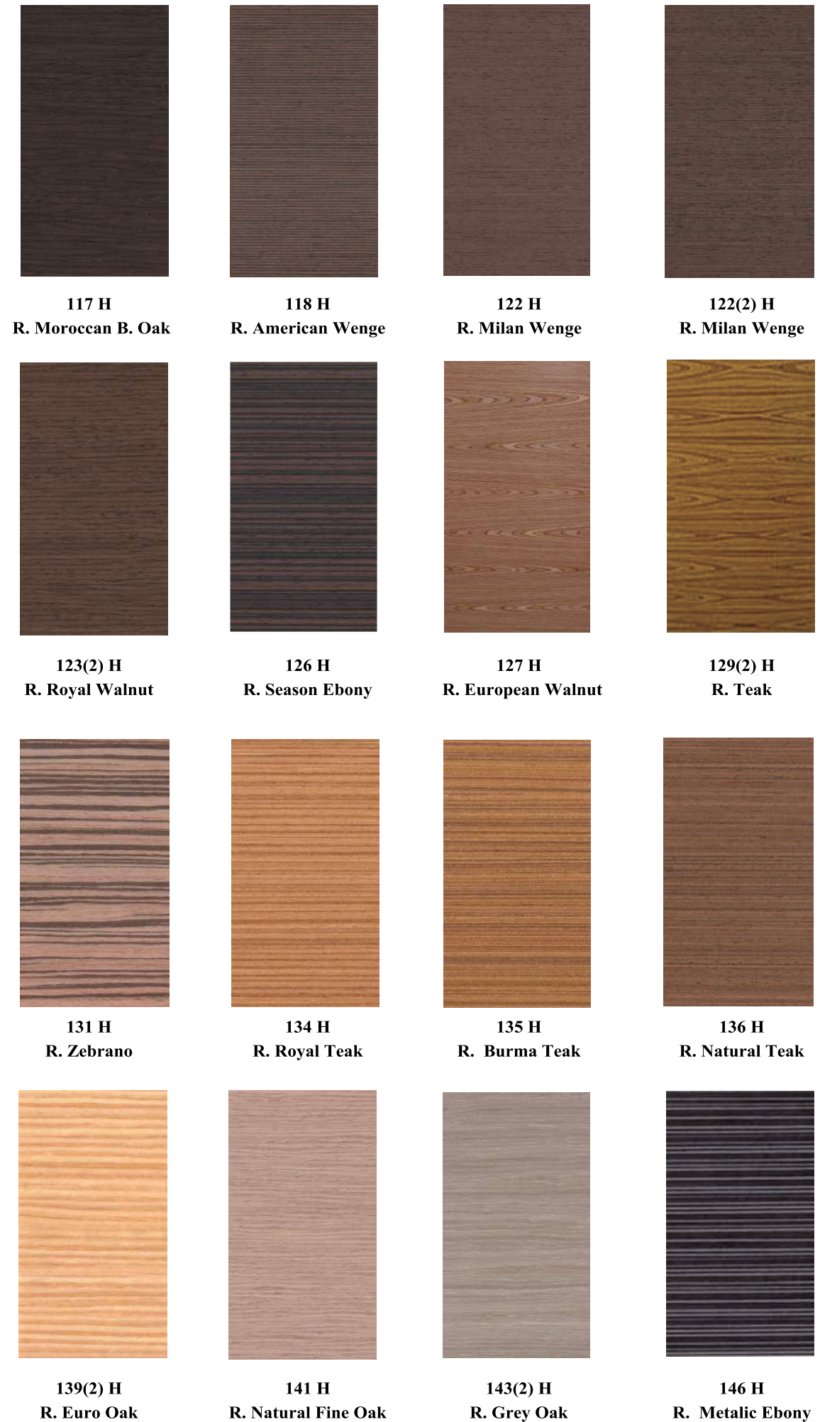
All the products shown here are before varnishing. Veneer colour will change after varnishing process.