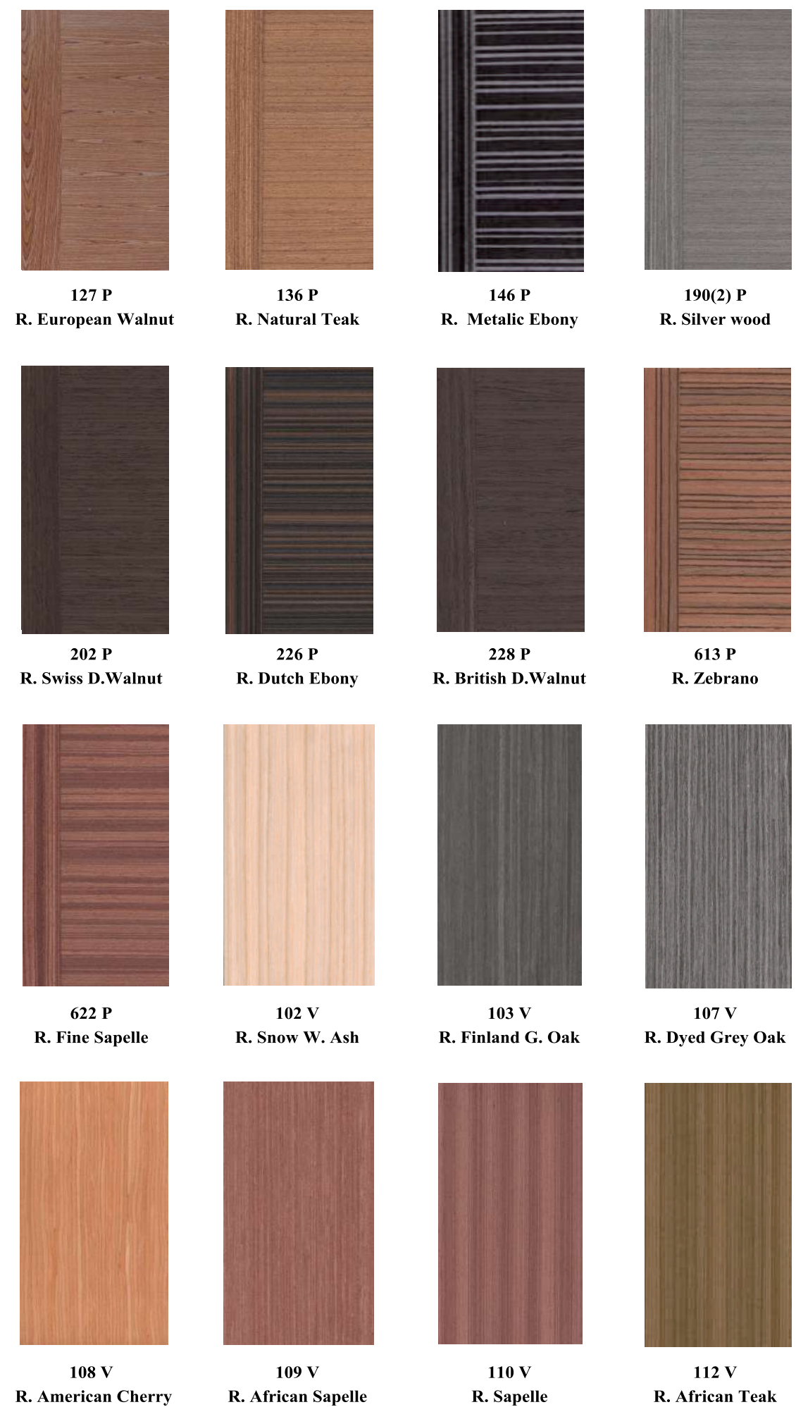
All the products shown here are before varnishing. Veneer colour will change after varnishing process.