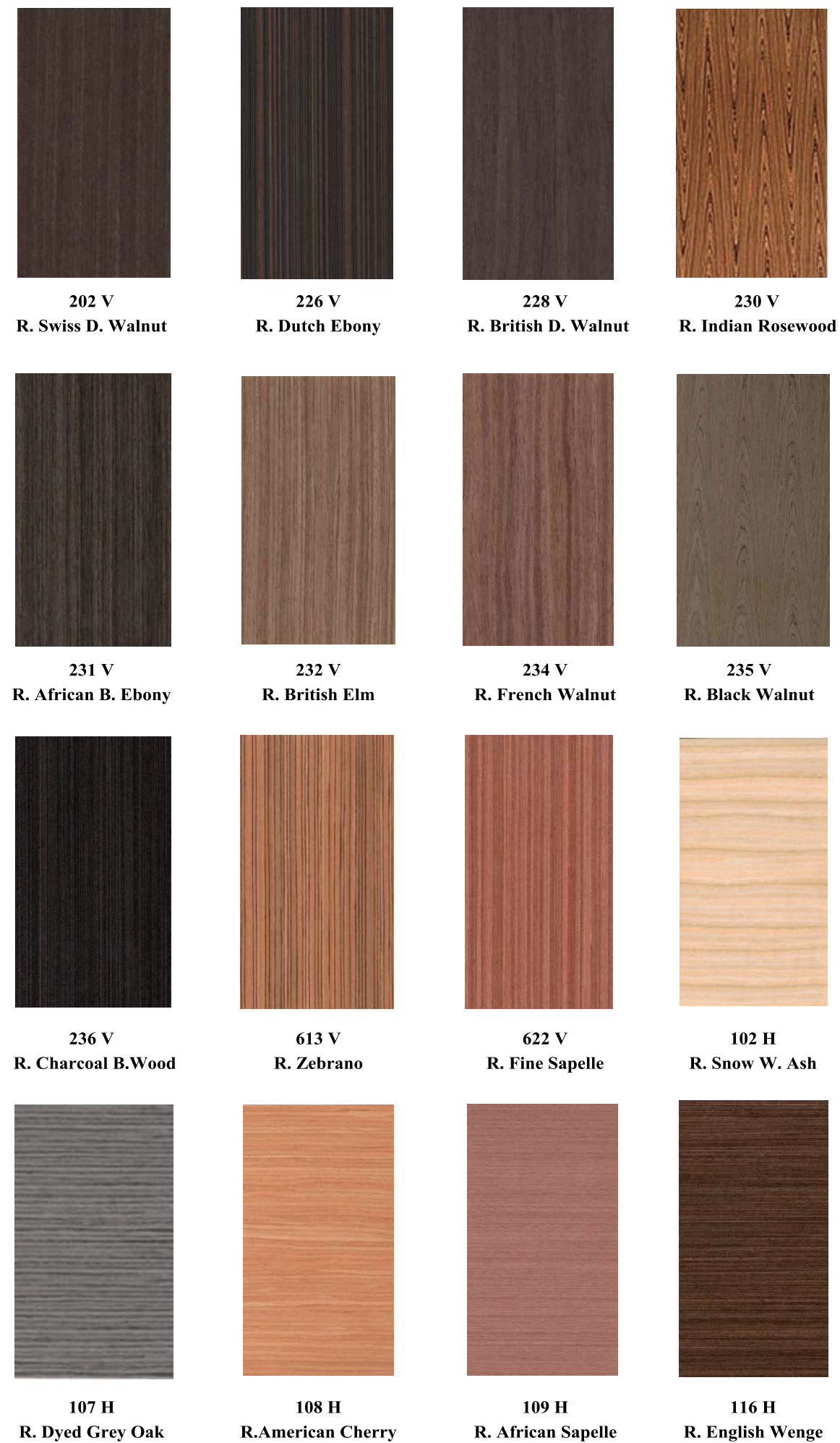
All the products shown here are before varnishing. Veneer colour will change after varnishing process.